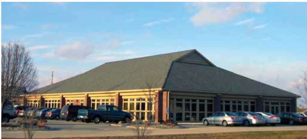
TOP: AOCS headquarters at 2211 West Bradley Avenue in Champaign, dedicated on November 4, 1999. BOTTOM: AOCS headquarters at 2710 South Boulder Drive, Urbana, fall 2006.

the staff’s goal was for the society to “hang on for the 100th (anniversary).”